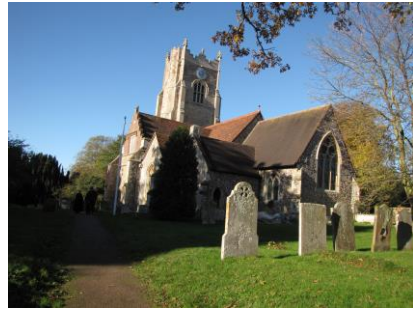
St. Andrew's Church

The name "Yeldham" is a corruption of "Geldham" recorded in the Domesday Book of 1086. The latter comes from the Saxon ' ham ' meaning Homestead and ' Geld ' denoting a tax, hence Geldham – a settlement paying a certain tax.