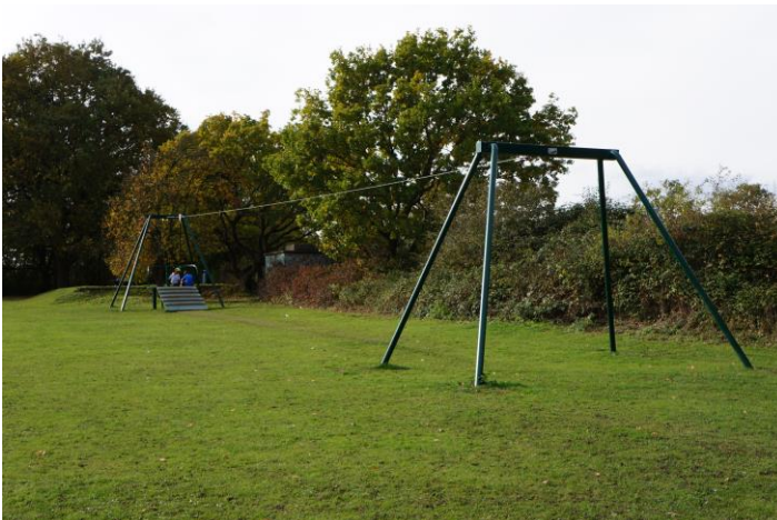
Zip Wire, Sports & Recreation Ground Toppesfield Road

The Sports and Recreation Ground facilities include a Pavilion (for hire) Skateboard Park, BMX Cycle track, football pitches, basketball nets, outdoor exercise equipment and the zip wire. The local Scout Hut is also located on site.