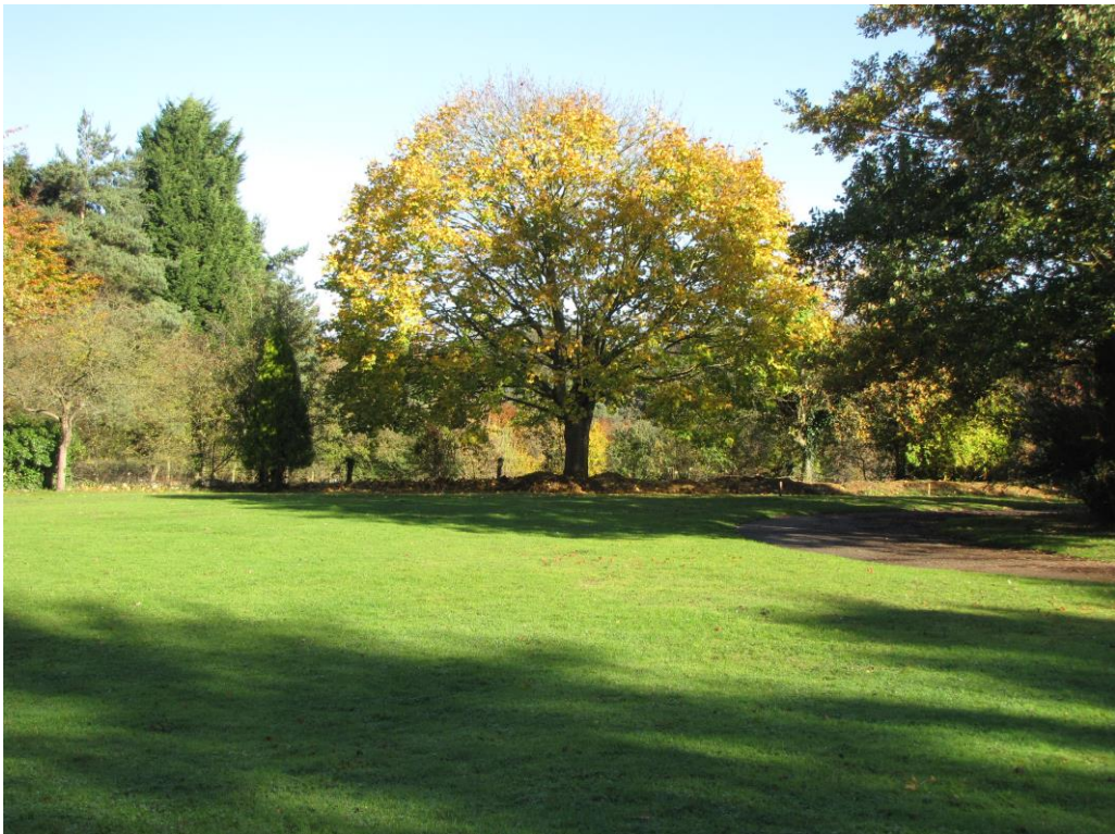
View of the Cemetery and Glades Natural Burial Ground Great Yeldham