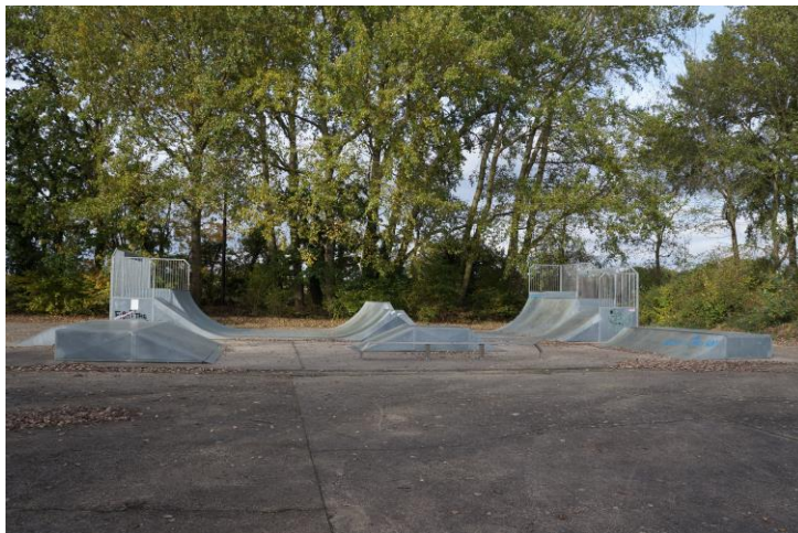
Skate Park, Sports & Recreation Ground, Toppesfield Road

In partnership with the Sports and Recreation Ground Management Committee, the Parish Council is working to regenerate the ground. A Sports Ground Strategy document has been prepared, see website for further details.