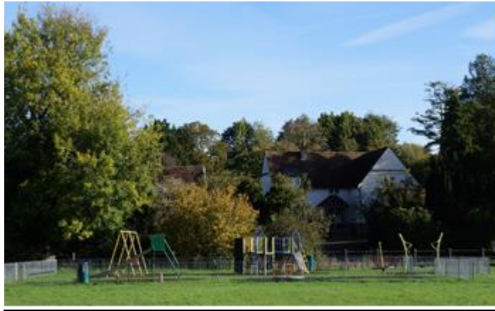
Play Park, Bowtells Meadow, North Road.

The children's play park located on Bowtells Meadow includes swings, slide, multi-climbing frame, momentum disc, skateboard swing and roundabout.