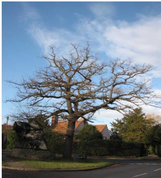
The "Young Yeldham Oak" (now more than 150 years old) stands guard over the stump of the old tree.